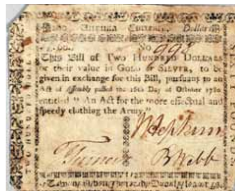
Shown are two examples of Virginia currency issued during the Revolution. An eight-dollar note issued in 1777 features the new state symbol, a figure representing Virtue with the motto SIC SEMPER TYRANNIS (thus always to tyrants), which was adopted by Virginia in 1776. A 1780 note was issued to fund clothing for Virginia troops.

Artifacts in the collection of the Jamestown-Yorktown Foundation.