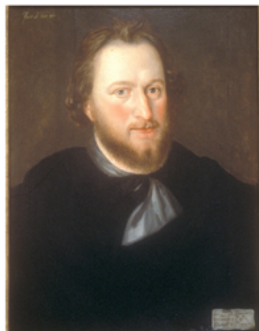
Thomas West, third Baron de la Warr, oil on panel, English, circa 1605. Jamestown-Yorktown Foundation, gift of the Gladys and Franklin Clark Foundation.

As the colony’s first governor the Company selected Sir Thomas West , third Baron de la Warr. West was a cousin of Queen Elizabeth I and a member of the Privy Councils of both Elizabeth and James I. He participated in the English military campaigns in Ireland and held the largest number of shares of stock in the Virginia Company of London. Lord de la Warr was unable to assume his duties in 1609, however, and the Company appointed a lieutenant governor, Sir Thomas Gates , to go in his stead.