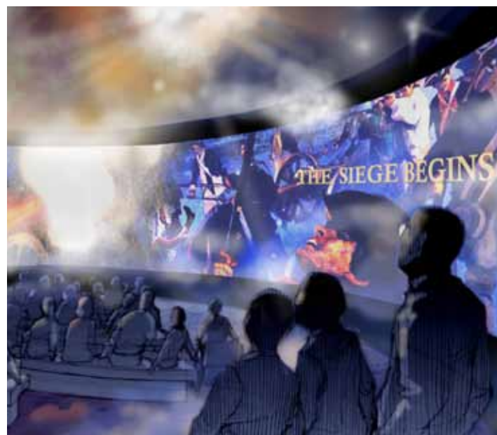
An experiential film in the new museum galleries will transport visitors to the battlefield at Yorktown in 1781. Private funds are supporting production of gallery films.